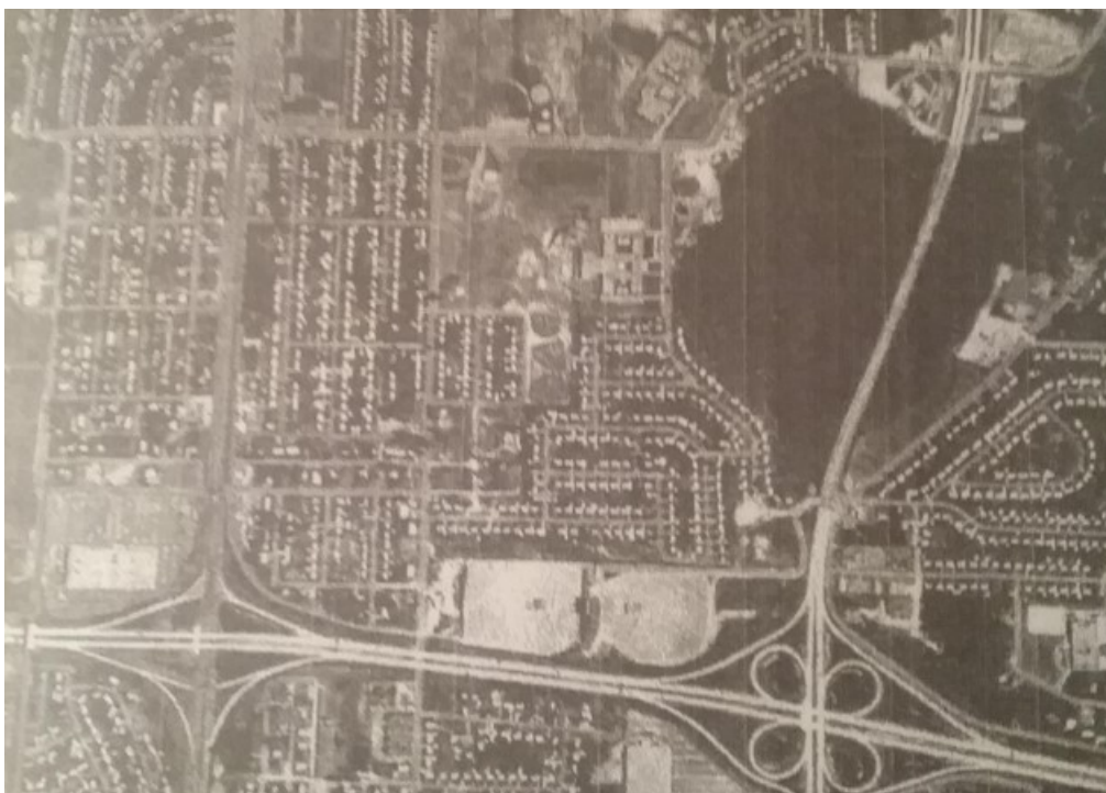
View of Fridley circa 1968.

A popular exhibit at the history center are two large pictures in the basement and visitors enjoyed trying to locate their homes before and after they were built. It is very interesting as share their memories of the area. Come to see the pictures yourself at our next open house.