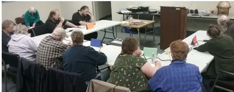
The two-person teams had 15 minutes to complete the written portion of the trivia contest.