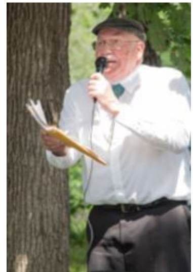
“Secret Cemetery” Guide