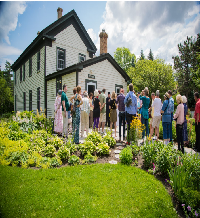
The crowd gathers outside of the John Banfill House, now the Banfill-Locke Center For The Arts.