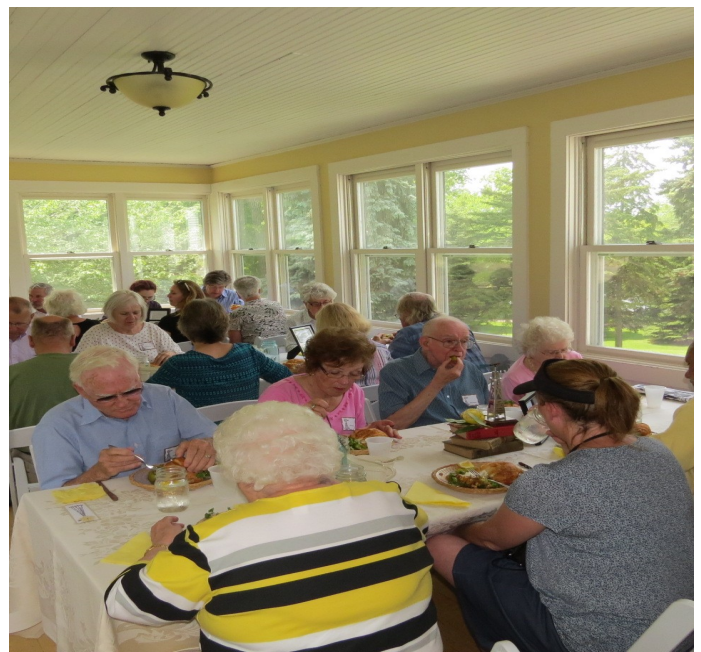
A meal typical of the era was served.