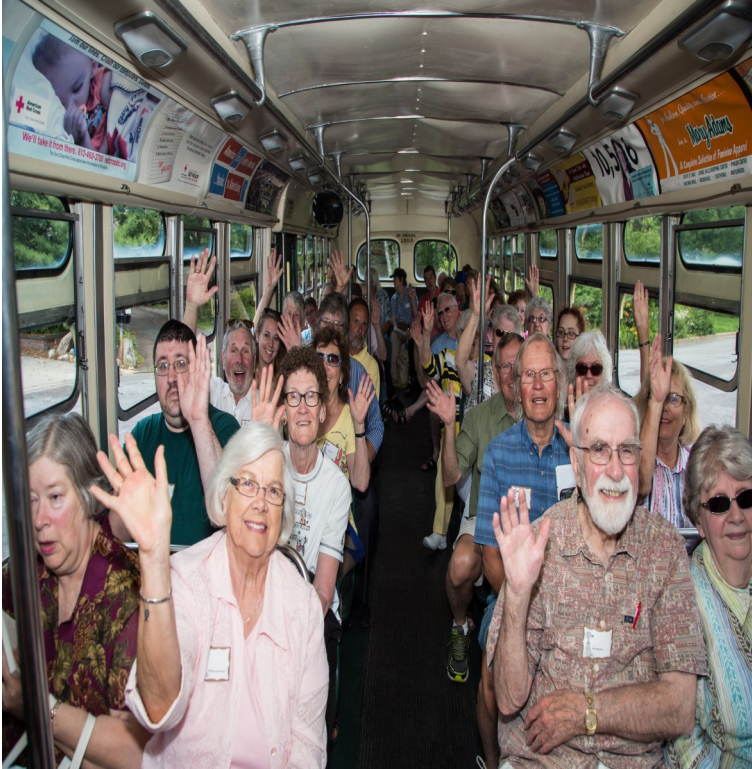
The tour group enjoying the ride on a restored 1950s bus.