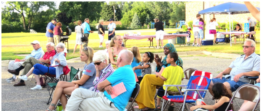
Some of the audience enjoying the band concert