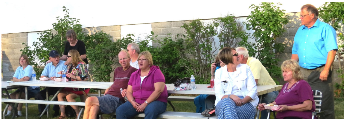
More of the audience enjoying the band concert