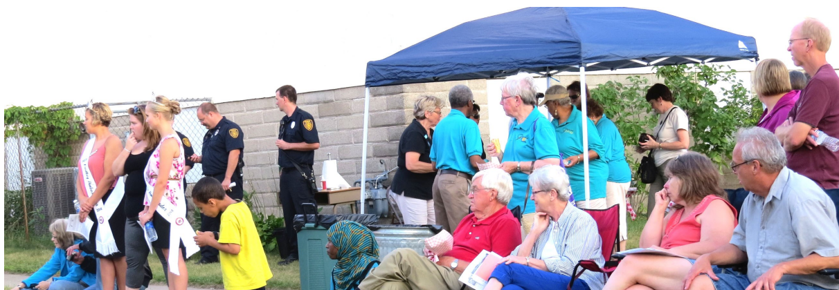
Watching the Quick Steps demonstration