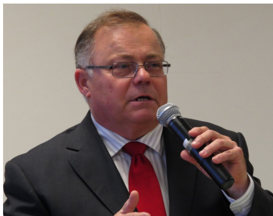
Mayor Scott Lund