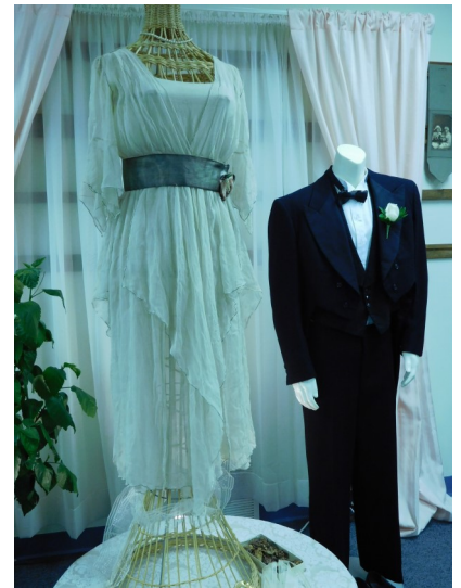
1920s bridal fashion.