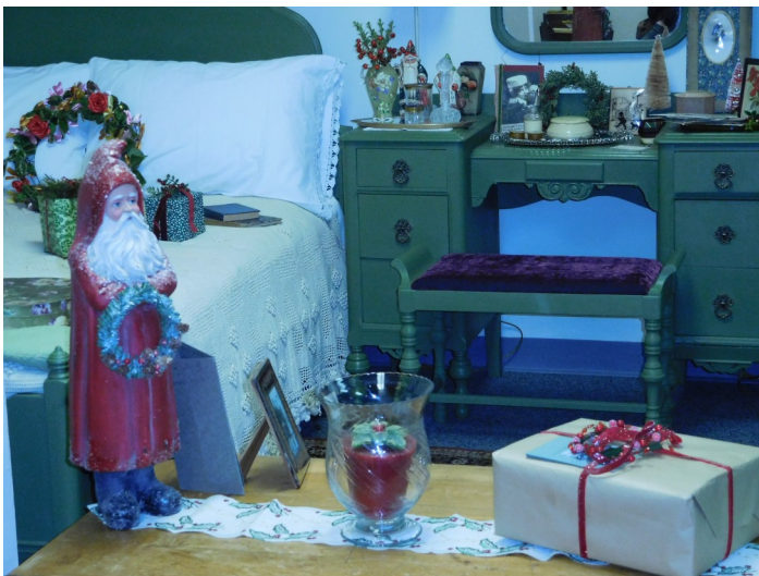
This bedroom area includes many interesting pictures.