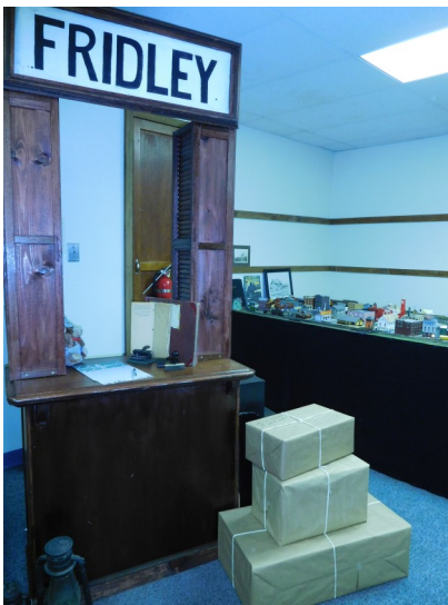
Welcome to Fridley!

This is just small sampling of everything to see at the exhibit. Be sure to enter your free ticket into the fishbowl at the speakeasy and you may be eligible for a special drawing to be held on Saturday December 19th, when an afternoon of live jazz will be the highlight of our December dates. Mark you calendar!