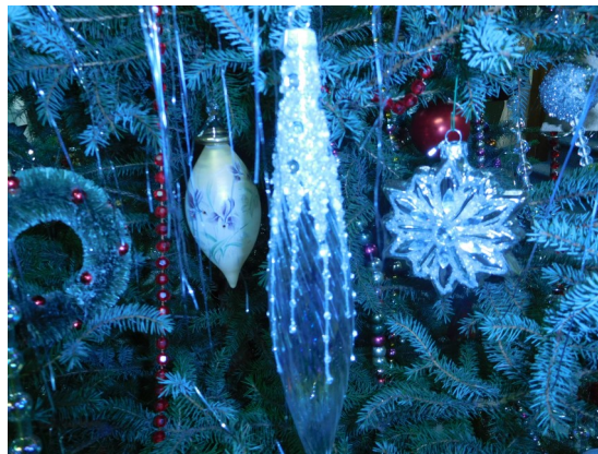
In the center of it all, a beautifully decorated tree.