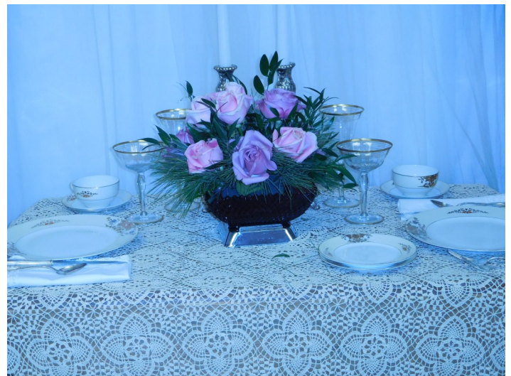
A beautiful table setting!