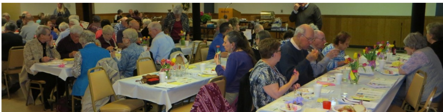
Attendees enjoying dinner and conversation.

Your support of the Fridley Historical Society is greatly appreciated!