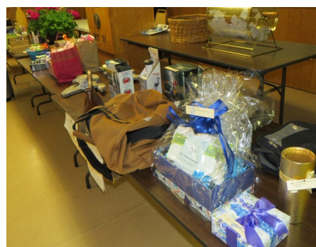
These three pictures show just a few of the sweepstakes prizes and auction items.