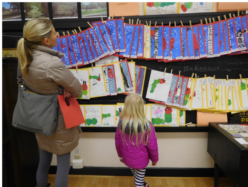
A mother and child admire the display.